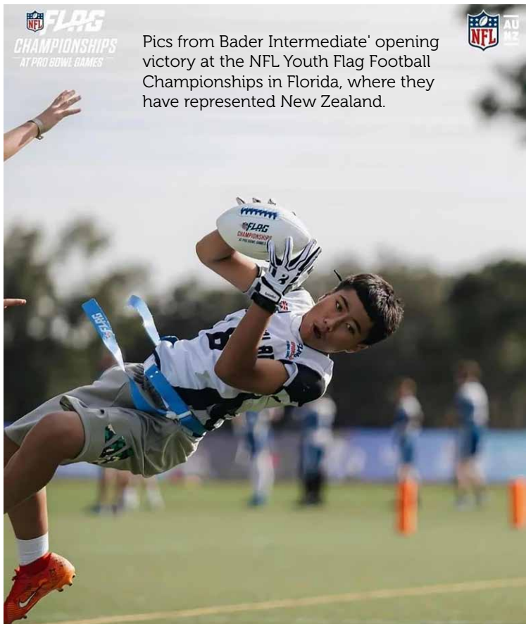
Pics from Bader Intermediate' opening victory at the NFL Youth Flag Football Championships in Florida, where they have represented New Zealand.