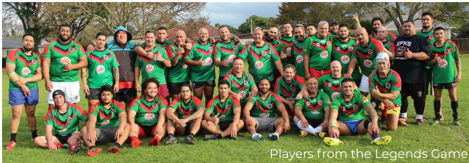
Players from the Legends Game.