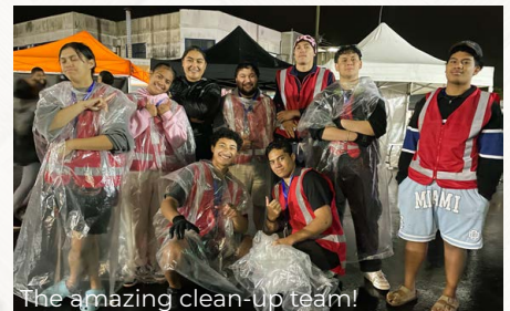
The amazing clean-up team!

In its fourth year running, Two Seven Five Day, a day dedicated to Māngere, was a resounding success with over 4,000 attendees.