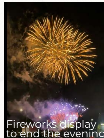
Fireworks display to end the evening