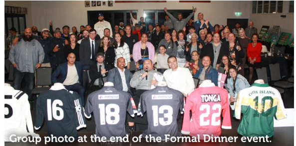
Group photo at the end of the Formal Dinner event.