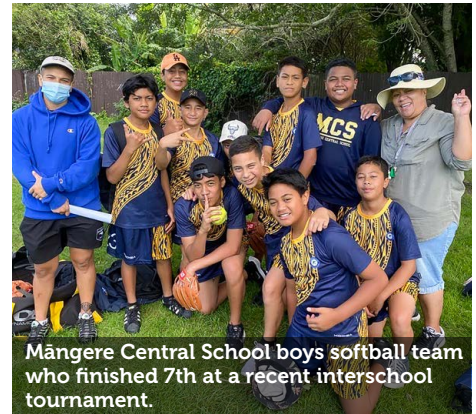
Māngere Central School boys softball team who finished 7th at a recent interschool tournament.