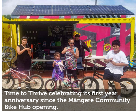
Time to Thrive celebrating its first year anniversary since the Māngere Community Bike Hub opening.