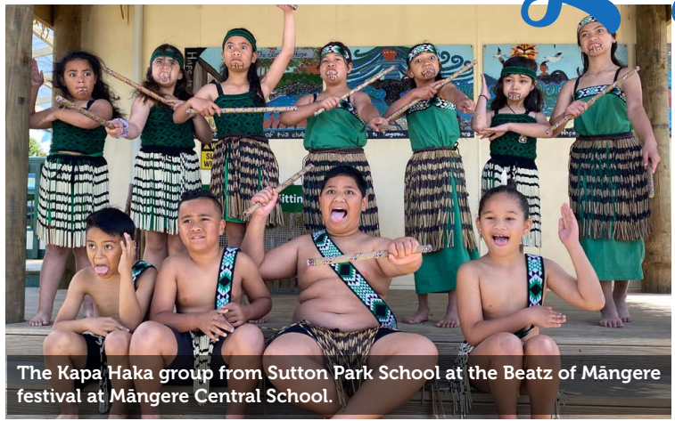
The Kapa Haka group from Sutton Park School at the Beatz of Māngere festival at Māngere Central School.