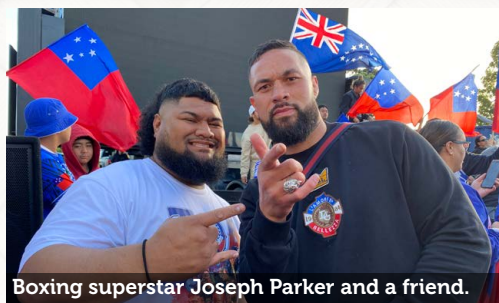
Boxing superstar Joseph Parker and a friend.