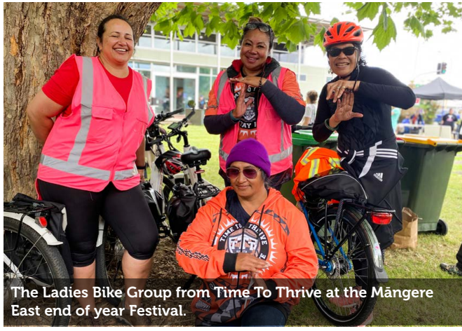
The Ladies Bike Group from Time To Thrive at the Māngere East end of year Festival.