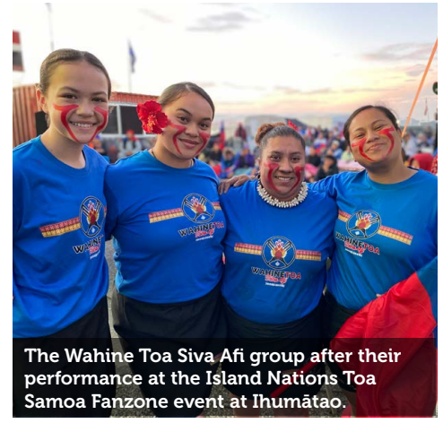
The Wahine Toa Siva Afi group after their performance at the Island Nations Toa Samoa Fanzone event at Ihumātao.