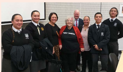
Te Kura Māori o Ngā Tapuwāe at the DLC Hearing in 2020