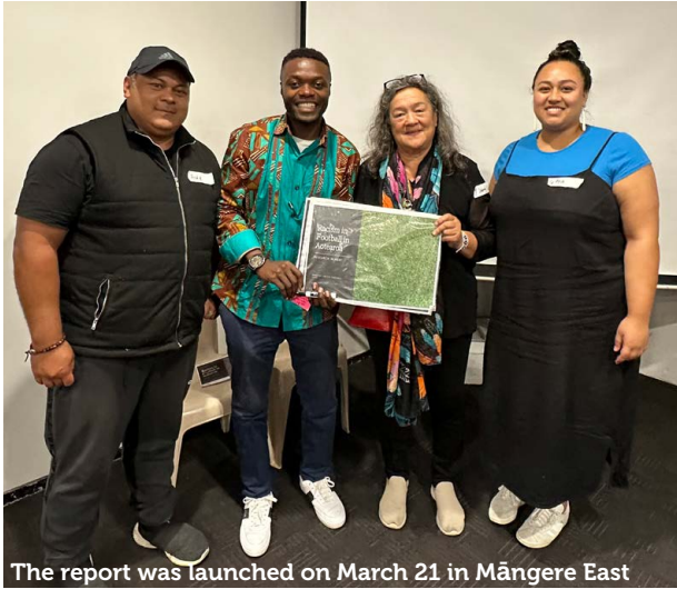
The report was launched on March 21 in Māngere East

uses it as motivation rather than let it rattle her.