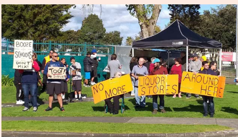
Community protest outside Thirsty Liquor Wickman Way in 2019

THURSDAY 27 APRIL, 9:30AM MĀNGERE CENTRAL COMMUNITY HALL, 241 KIRKBRIDE ROAD, MĀNGERE