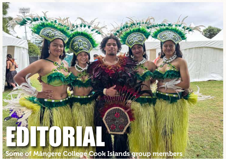
Some of Māngere College Cook Islands group members

Job seeking: www.connected.govt.nz/support-for-you/find-work-now/