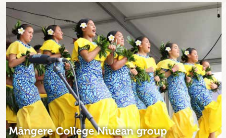
Māngere College Niuean group