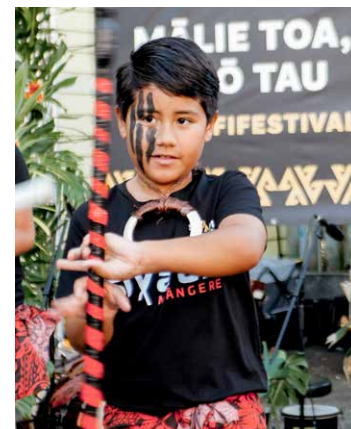
Photos from the annual international Siva Afi Festival, which was held at the Māngere Arts Centre by Siva Afi Aotearoa.