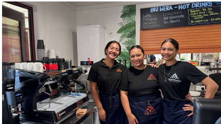
The Koha Cafe has just opened up at Papatuanuku Kokiri Marae, open every Thursday and Friday 10am-2pm. Head along for tasty, healthy kai and coffee, donate a koha or receive a free meal if in need.