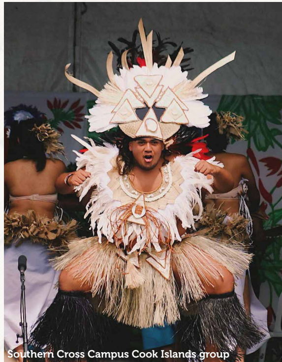
Southern Cross Campus Cook Islands group