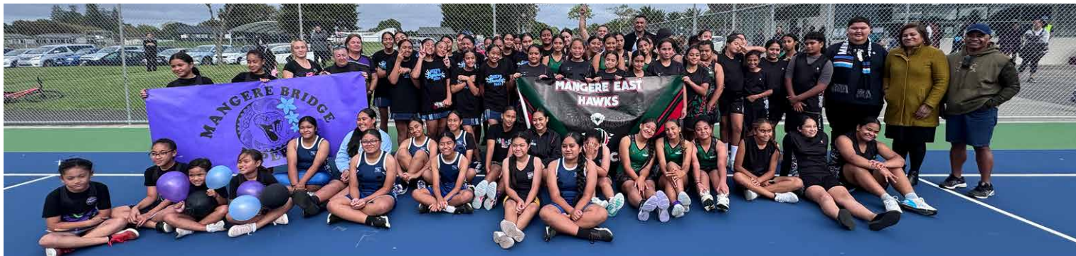
The blessing of the resurfaced netball courts at the Māngere Ōtāhuhu Netball Centre. Thank you to the local board for helping to fund this project.

Email 275times@gmail.com if you want to include a photo here.