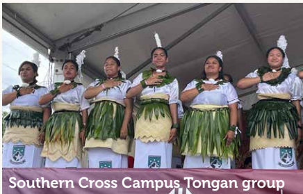
Southern Cross Campus Tongan group