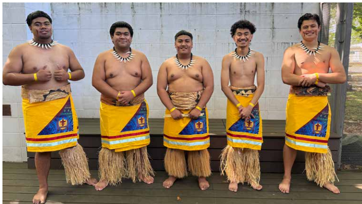
De La Salle 'Ra Siva' group at the Māngere East Cultural Festival.