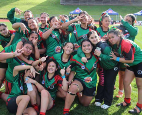
The Mangere East U14 Hawks Girls after winning the title for the season.