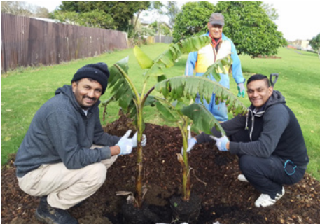
Ashgrove Reserve Planting Day.