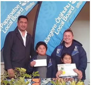
Winners of the Moth Plant Competition!