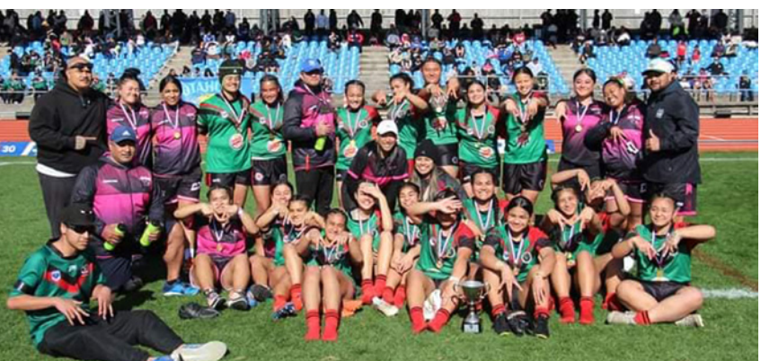
The Mangere East U16 Elite Queenz, back to back champions after winning the title for two seasons in a row!