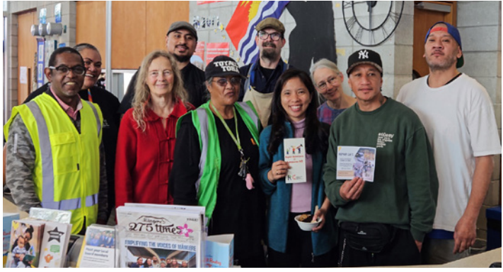
Some of the team behind the Māngere Repair Cafe, at the Māngere East Library in July. Many community groups came together with the goal of reducing waste here in Māngere.