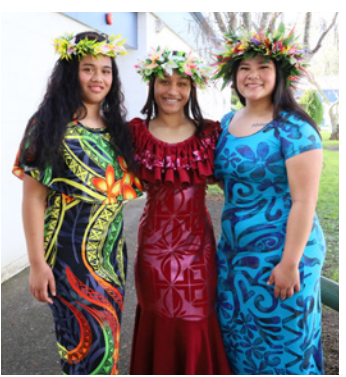
Māngere College students during Cook Islands Language Week.